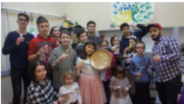
Children happily took part in Kabbalat Shabbat prayer,

Parasha Shavua peula, reading Jewish stories and playing funny games. Twice every week is working on NOAM activity program. This month, mostly all peulot were dedicated to the Weekly Torah Portions and Pesach. There were nearly 10 people.