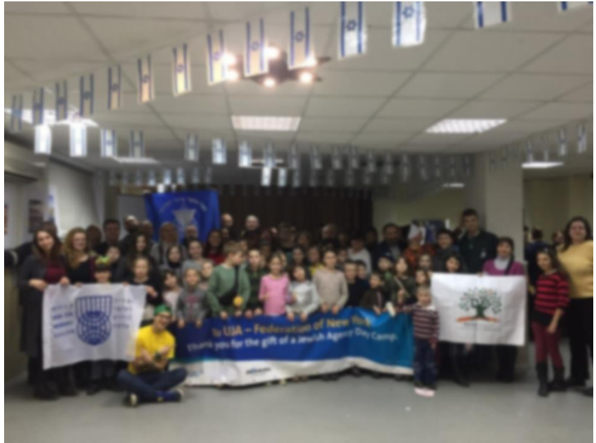
March 26-27 – NOAM Day Camp