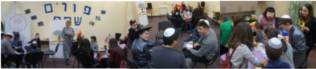
Purim Party for teenagers

was held by madrichim in Kyiv Masoret Community on Saturday evening immediately after avdala. Teens were glad to take part in competitions between two teams of the boys and the girls. Each of the team prepared their funny Purim sketches with the main characters of Purim's story. Teenagers were not afraid to use their imagination and fancy dress in the Purim sketches that is why it turned out so funny and interesting. Also, each participant had an opportunity both to cook and to have a meal and it is important that they did it altogether. At the end of the party all the children danced discotheque music, played board games and communicated with each other and madrichim. It is fair to say that all the participants were full of feelings and new knowledge about Purim, because nobody wanted to leave the party at the end.